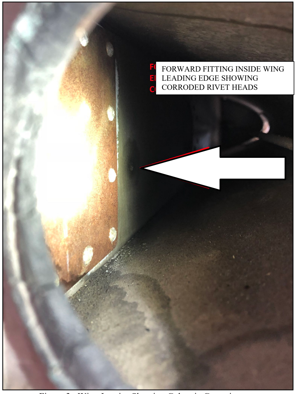
Figure 3. Wing Interior Showing Galvanic Corrosion