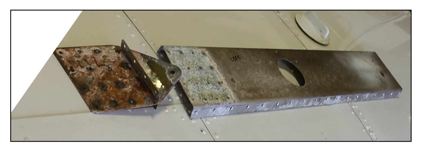
Figure 2. PA-28 Corroded Forward Attach Fitting and Spar Section (removed)